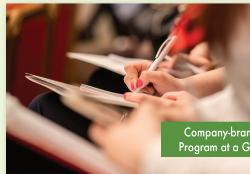
Company-branded Program at a Glance