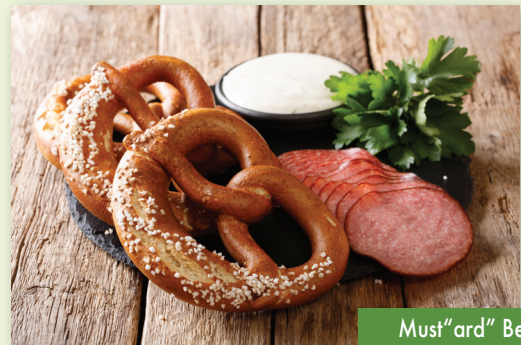
Must"ard" Be Break Time Station