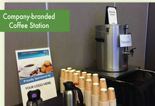
Company-branded Coffee Station